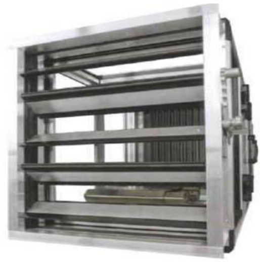
Damper with thermal break blades assembled on AHU