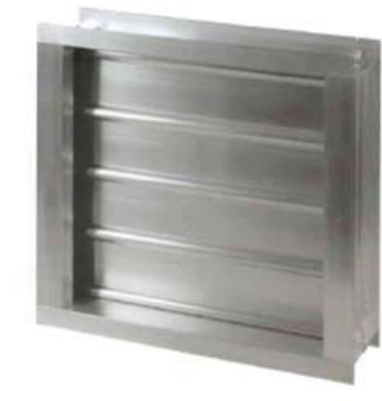
Gravity Damper assembling scheme