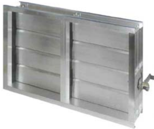
Double Damper assembling Scheme