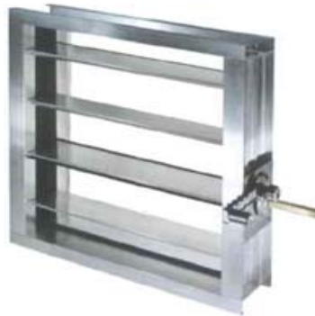
Single Damper assembling Scheme