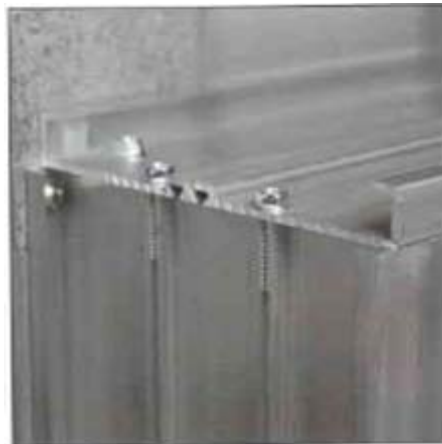
Special "Guide" lock:detail